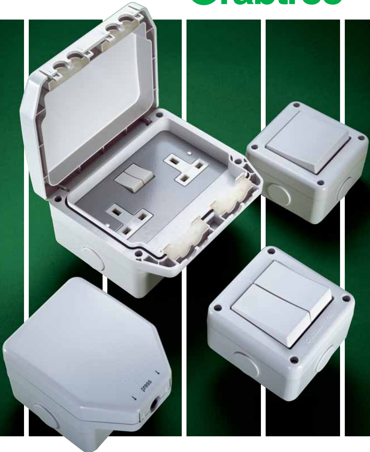
2009 Weatherseal water and dust protected