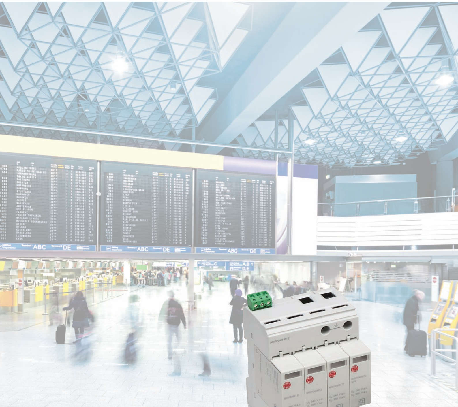
Integral Surge Protection Kits for Type B Distribution Boards